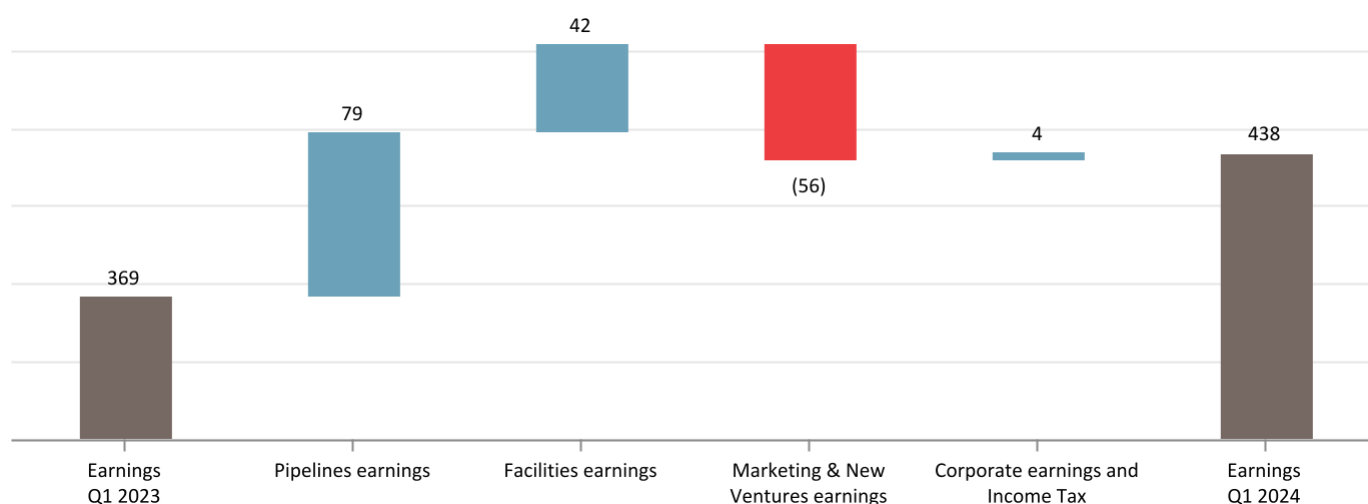
Change in First Quarter Earnings ($ millions)

Pembina reported first quarter earnings of $438 million, representing a $69 million or 19 percent increase over the same period in the prior year.