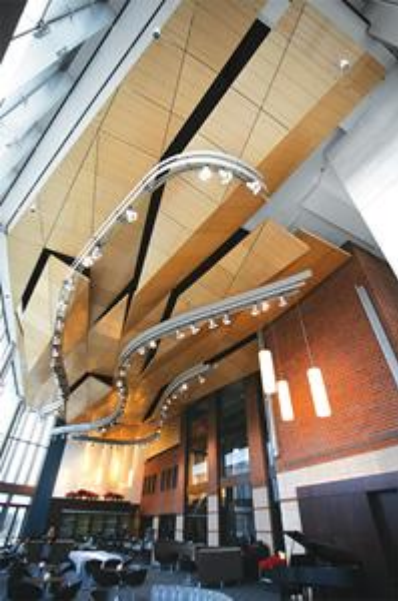
ACGI Encore™ Acoustical Panels - The Peace Center for the Performing Arts, Greenville, SC