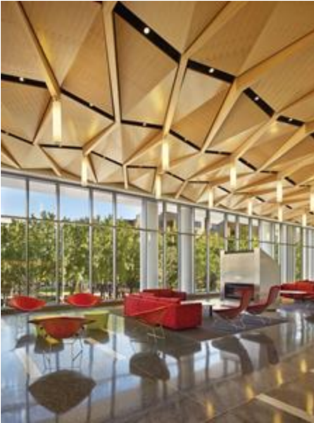
ACGI Beams & Encore™ Acoustical Panels - Temple University, Philadelphia, PA