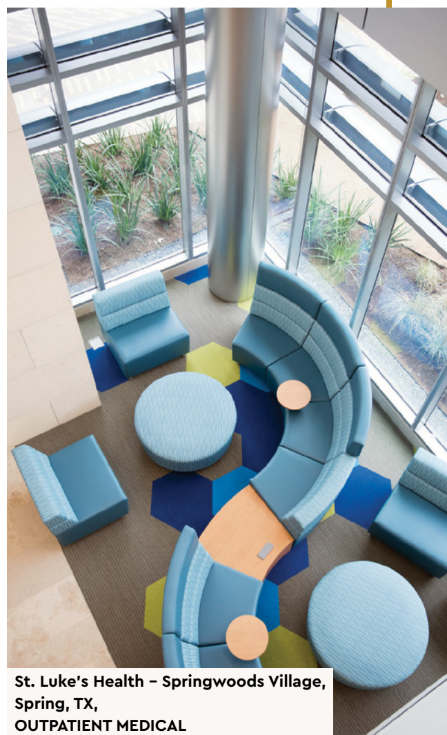
St. Luke's Health – Springwoods Village, Spring, TX, OUTPATIENT MEDICAL

Our CCRC business produced record results in 2024, driven by occupancy growth and rate growth, as consumers appreciate the value proposition of our highly amenitized properties. The business is currently in an upcycle that is benefiting our earnings growth.