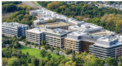
CAMBRIDGE DISCOVERY PARK CAMBRIDGE, MA

New and innovative drugs, therapeutics, and medical devices are developed in our lab properties