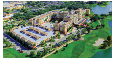
FREEDOM POINTE AT THE VILLAGES THE VILLAGES, FL

Offers seniors an active lifestyle, peace of mind, security, and continuum of care in a highly amenitized campus setting