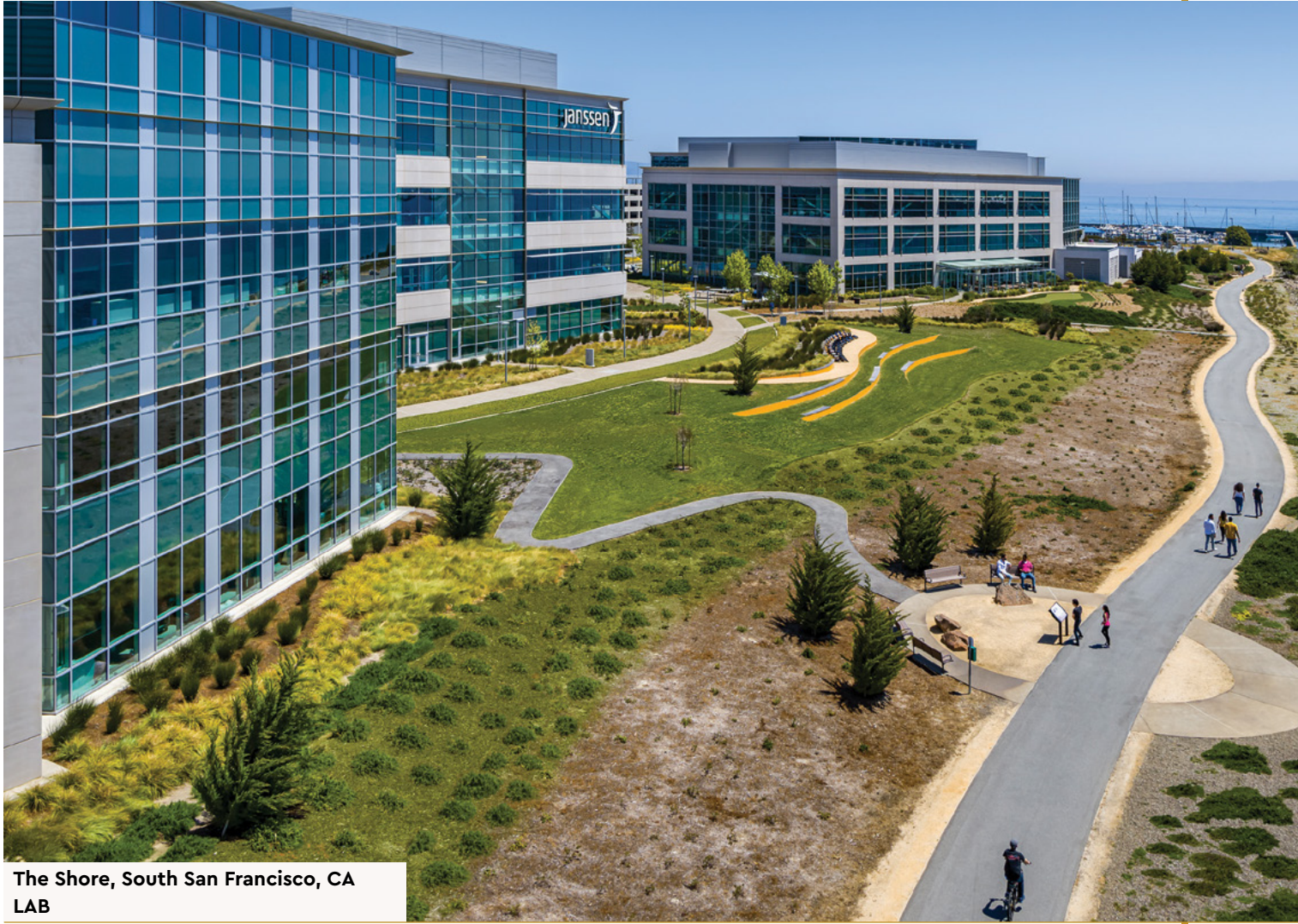
The Shore, South San Francisco, CA LAB