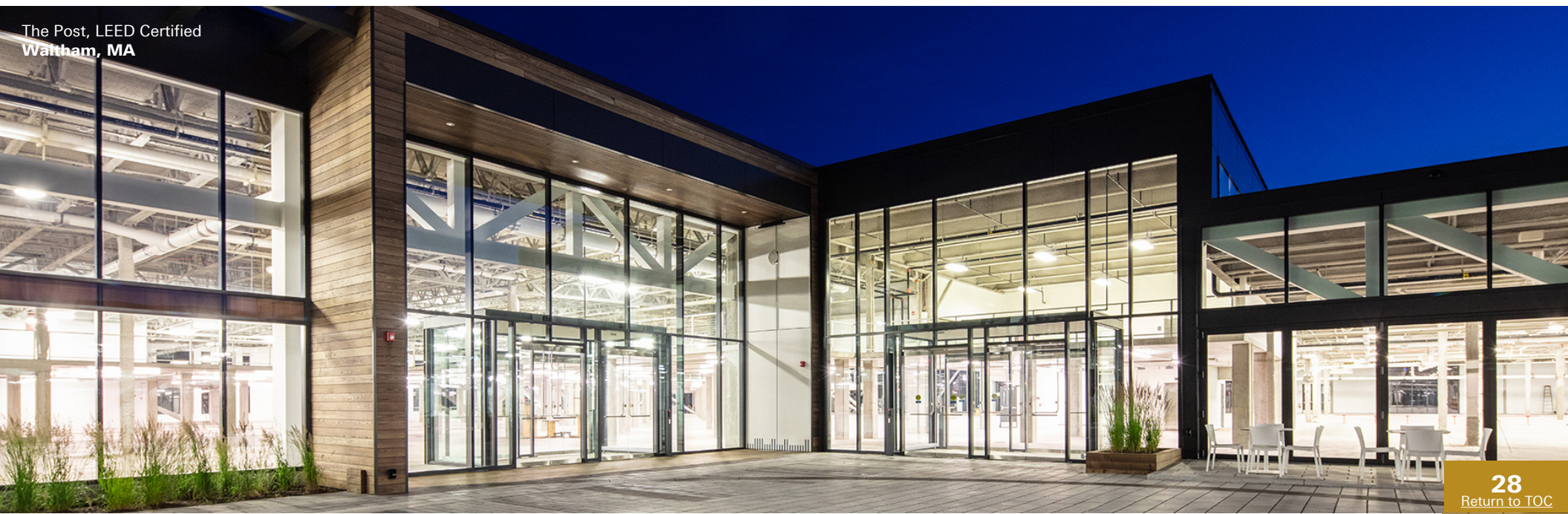
The Post, LEED Certified Waltham, MA

(2) Includes month-to-month and holdover leases.