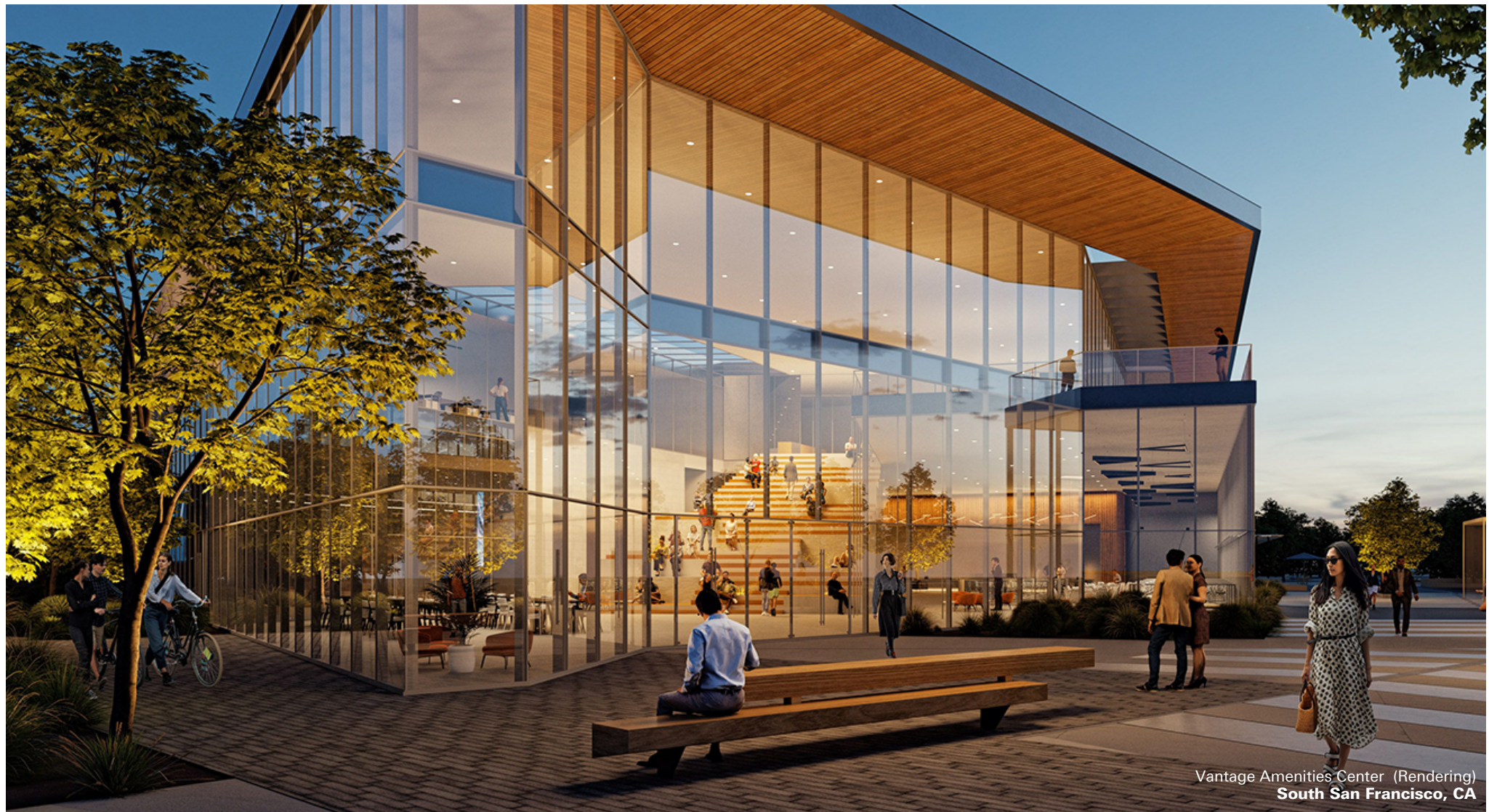
Vantage Amenities Center (Rendering) South San Francisco, CA