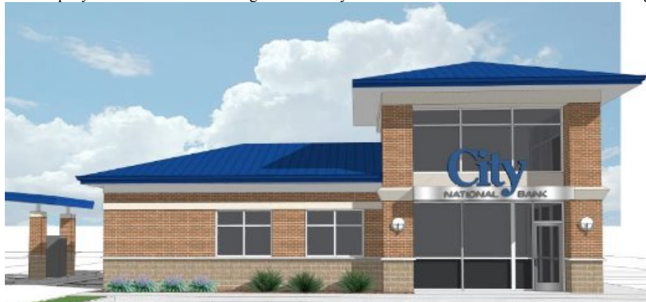
Rendition of the Company's Morgantown branch expected to open in 2018.

On October 16, 2017, the Company announced it will break ground in early 2018 on its new branch office located in Morgantown, West Virginia.