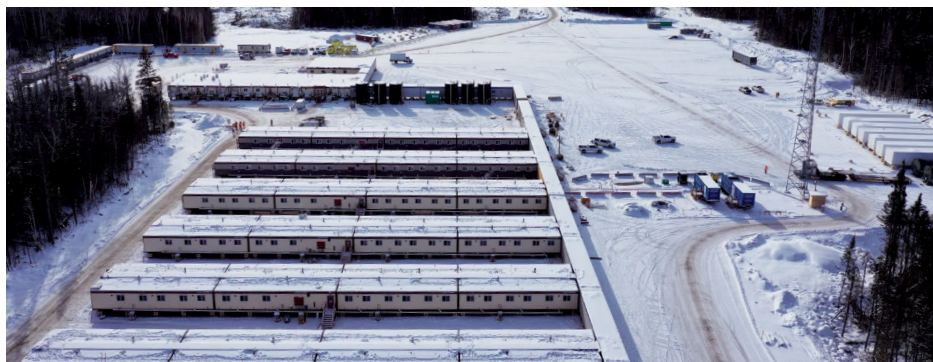
An aerial view of the construction camp and permanent camp site.

Work on the bus terminals in Timmins and Sudbury has finished. Employees have started commuting to site via these terminals. Buses operate three days per week.