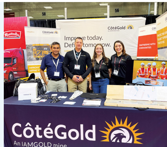
Côté Gold's presence at the Canadian Mining Expo 2024 in early June ▶

Côté Gold was excited to participate in the Canadian Mining Expo 2024, held from June 4th to 6th in Timmins, Ontario. As a gold sponsor, we participated in the Expo alongside over 400 exhibitors at the trade show, connecting with industry peers, communities, suppliers, job seekers and potential investors. We were also honoured to attend the Gala Dinner & Awards Night, Big Social and the Indigenous Partnership Forum, where we engaged in meaningful discussions on how to partner with First Nation businesses. The Expo provided a significant opportunity to strengthen our relationships with various actors in the mining industry and discuss the future of mining and collaboration opportunities. Thanks to everyone who visited our booth and connected with us!