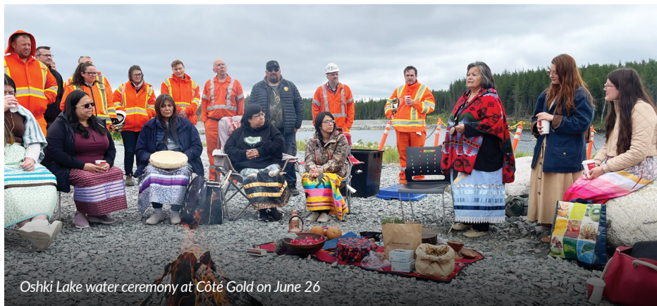
Oshki Lake water ceremony at Côté Gold on June 26