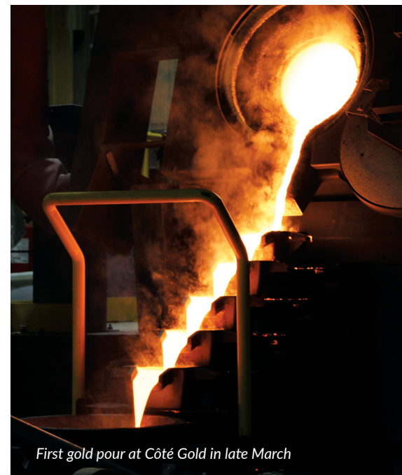
First gold pour at Côté Gold in late March