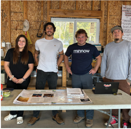
▲ Côté staff met with Minnow Environmental and community members for an update on the hatchery