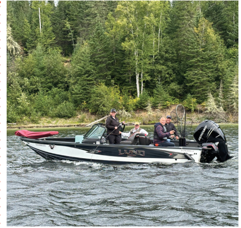
▲ The day finished on a high note with the group going salmon fishing together on Nipigon River!