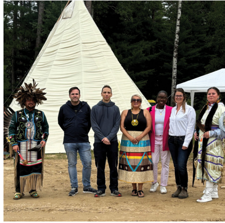
▲ Côté staff enjoying the Powwow

Côté Gold team members recently attended Mattagami Lake Week where they heard updates on the hatchery's progress.