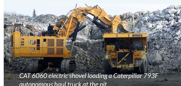
CAT 6060 electric shovel loading a Caterpillar 793F autonomous haul truck at the pit