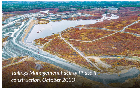
Tailings Management Facility Phase II construction, October 2023