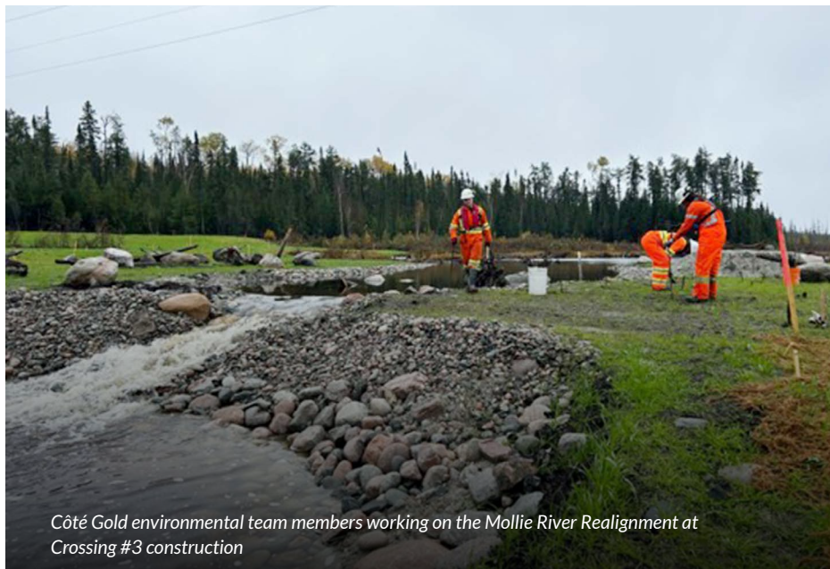
Côte Gold environmental team members working on the Mollie River Realignment at Crossing #3 construction

PAGE 4 Construction progress at Côte Gold