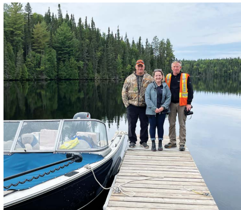
▲ Côté Gold team members taking a tour of the Mesomikenda Lake

The event allowed us to acknowledge and celebrate the work accomplished to date and engage in discussions about the much-anticipated launch of the Côté Gold mine in early 2024.