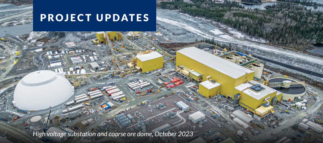
High voltage substation and coarse ore dome, October 2023