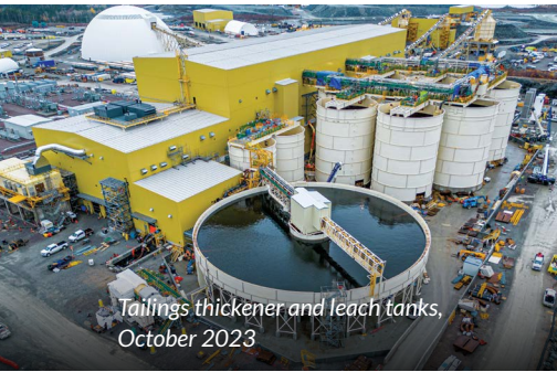
Tailings thickener and leach tanks, October 2023