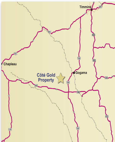
Côté Gold Project Location

IAMGOLD proposes to construct, operate and eventually rehabilitate a new open pit gold mine in north central Ontario near Gogama – the Côté Gold Project. The company is currently conducting engineering studies to further confirm and determine the technical and economic aspects of the project as well as pursuing environmental approvals from both the provincial and federal governments. The company operates mines in Quebec, South America and West Africa. This is IAMGOLD's first proposed Ontario-based mine.