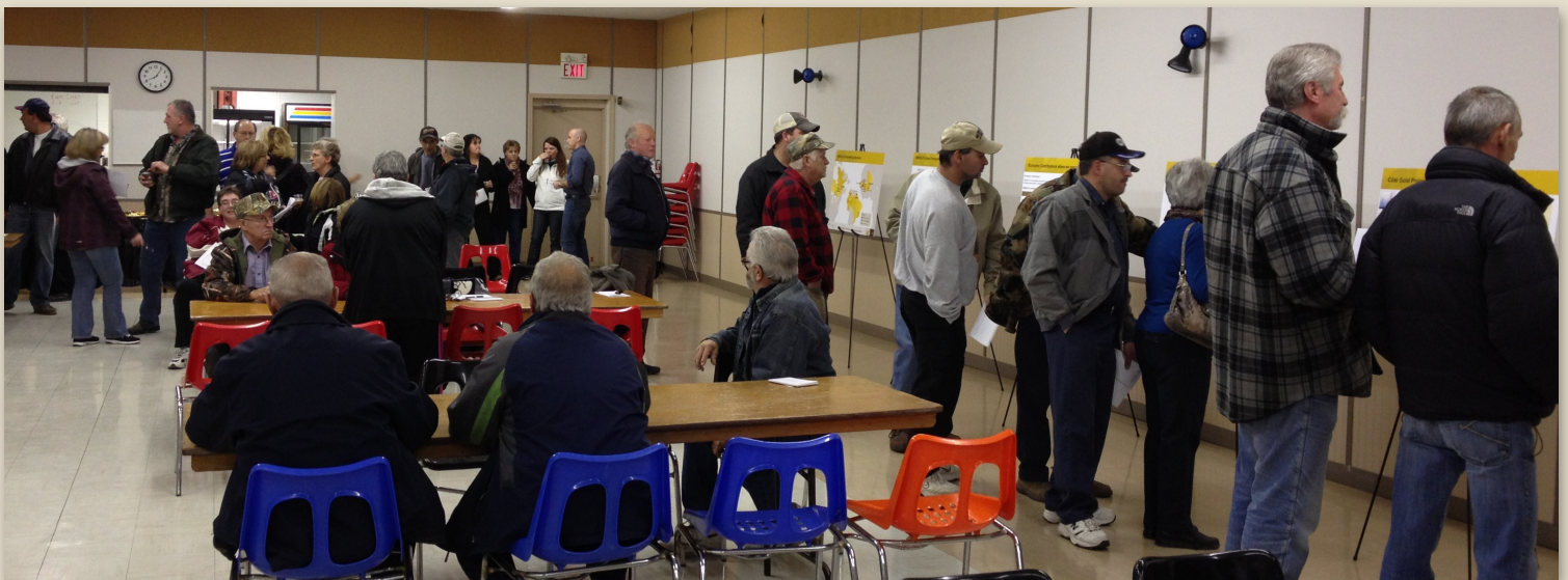
Gogama Open House, November 8, 2012

IAMGOLD is committed to involving Aboriginal people, governments, local communities and other stakeholders in the Côté Gold Project. IAMGOLD has met and will continue to meet regularly with its First Nation and Métis neighbours to discuss and actively involve them in the Côté Gold Project. IAMGOLD has an Exploration Agreement with the local First Nations.