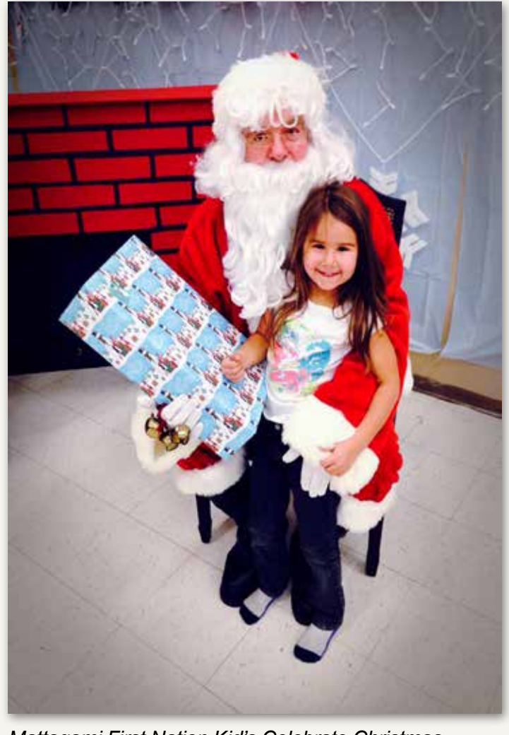
Mattagami First Nation Kid's Celebrate Christmas with IAMGOLD

If you are unable to attend one of our upcoming events in the Spring (2014), but want to discuss the Project with us, please contact us! Our contact details are listed below. You can also contact us to request to be added to our Project mailing list for invites to our future consultation events and to receive key updates on the Project.