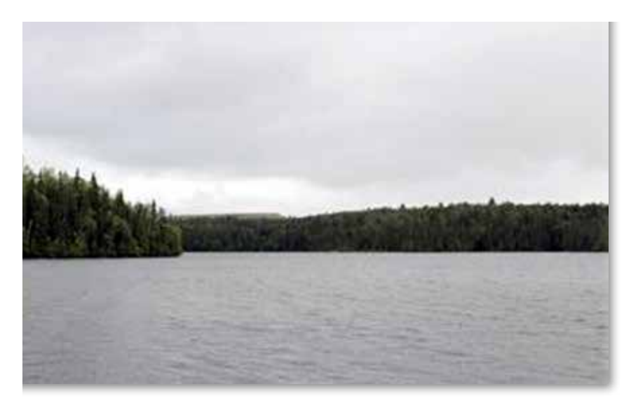
Visual rendering of what the Project will look like in the summer