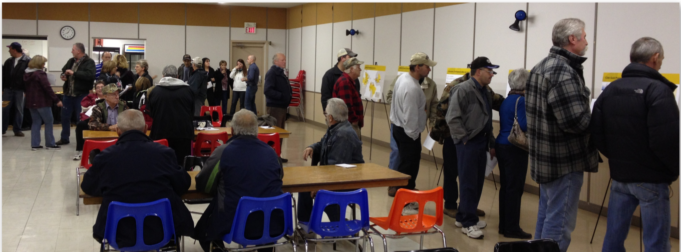
Gogama Open House, November 8, 2012

Attendees at the open houses indicated that they look forward to having work and business opportunities in the region as a result of the Project. Attendees also identified concerns related to the potential impacts of the Project on water (quality and quantity), noise levels, fish and wildlife, land use, the location of Project components as well as visual impacts. IAMGOLD is taking the comments and concerns from our neighboring communities into consideration as part of the Project planning.