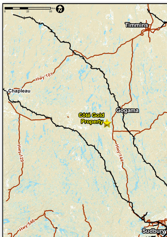
Côté Gold Project Location

In May 2013, the Agency provided draft Environmental Impact Statement (EIS) Guidelines for public review, which prescribe the scope of the Federal EA for the Project. Comments received on the draft EIS Guidelines will be considered before issuing the final EIS Guidelines to IAMGOLD. This comment period ended on June 12, 2013.