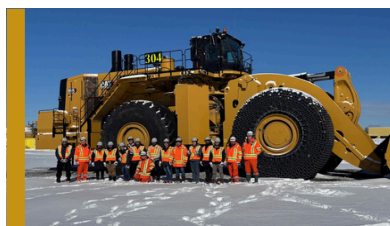
■ DEV FEST WINNING TEAM "THE ALPHA NOVA"