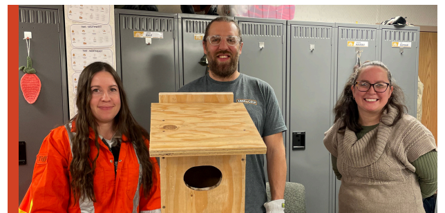
■ BUILDING DUCK NESTING BOXES FOR EARTH DAY