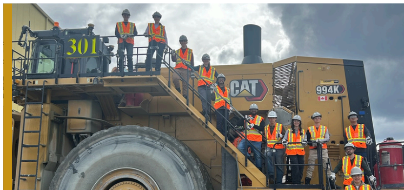
■ "THIS IS MINE LIFE" STUDENT TOUR

We love welcoming visitors to Côté Gold to inspire the next generation of mining professionals! Here are some recent visitors enjoying the sights and sounds of our bustling operation.