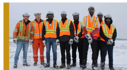
■ COLLÈGE BORÉAL PROSPECTING AND MINING EXPLORATION STUDENT GROUP