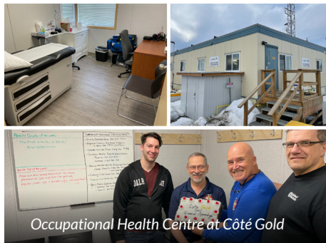
Occupational Health Centre at Côté Gold