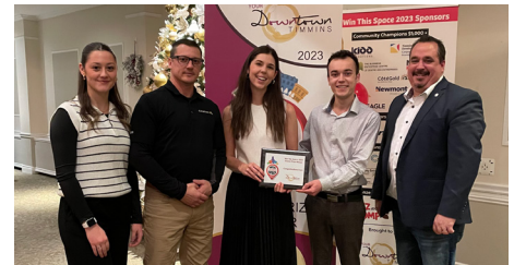
▲ Côté Gold sponsored and participated in the Win This Space event, promoting the entrepreneurial spirit in Timmins

In 2023, Côté Gold sponsored the Win This Space Downtown Timmins initiative hosted by Downtown Timmins and the Business Enterprise Centre. Win This Space is a business recruitment initiative that encourages participants to realize their dreams of entrepreneurship and equips them with the fundamentals required to succeed in business. Côté Gold representatives attended the Grand Finale held in Timmins on December 5, 2023. The Grand Prize Winner was awarded a rent-free storefront location for one year, allowing an aspiring entrepreneur the opportunity to bring their business to life!