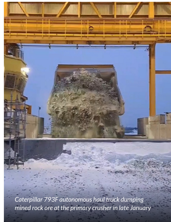
Caterpillar 793F autonomous haul truck dumping mined rock ore at the primary crusher in late January