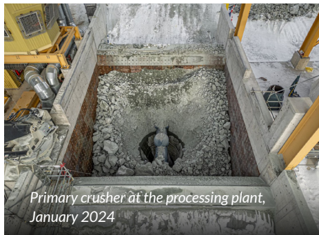
Primary crusher at the processing plant, January 2024