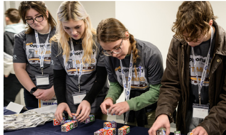
▲ Côté Gold sponsored and participated in the Mine Opportunity Challenge, connecting with high school students eager to learn about the mining sector in early December

On December 7, 2023, Côté Gold sponsored and participated in the Mine Opportunity Challenge Timmins Edition co-hosted by Mine Connect and the Laurentian University Goodman School of Mines. This was a great opportunity for us to connect with the future workforce of the mining industry, as high school students throughout Northern Ontario competed in a series of mining-related activities to become the ultimate mining champions. At Côté Gold, we promote youth participation in mining and trades.