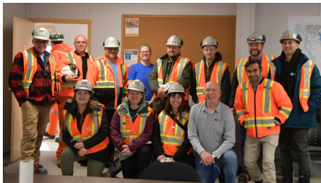
▲ Educators from various schools in Northern Ontario participated in a mining tour at Côté Gold in late November