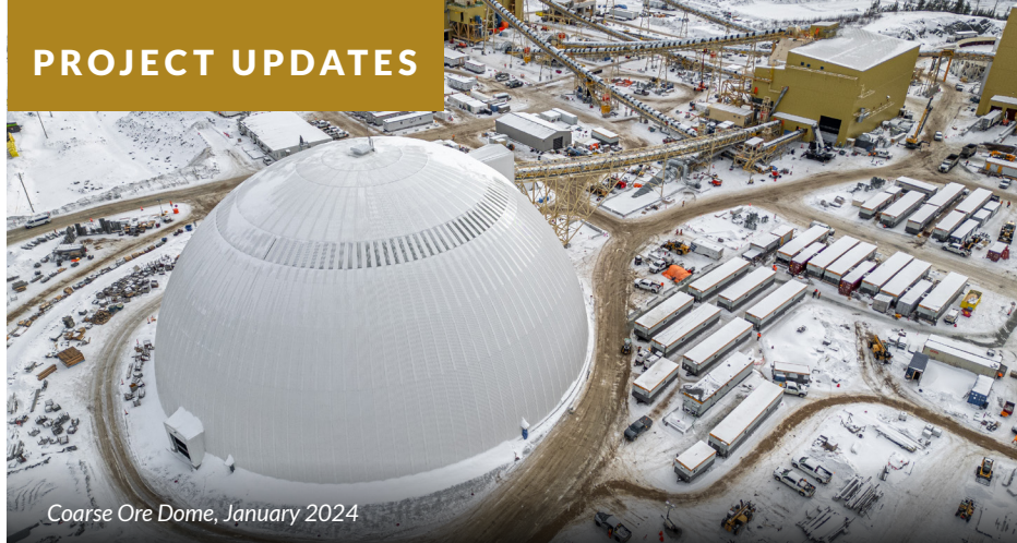
Coarse Ore Dome, January 2024