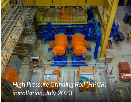
High Pressure Grinding Roll (HPGR) installation, July 2023