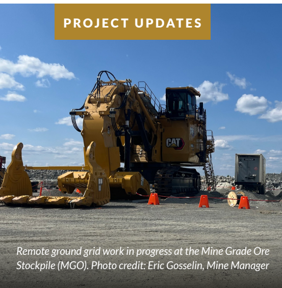
Remote ground grid work in progress at the Mine Grade Ore Stockpile (MGO).