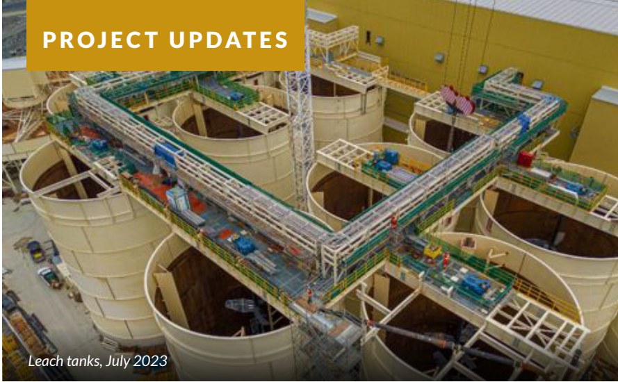
Leach tanks, July 2023