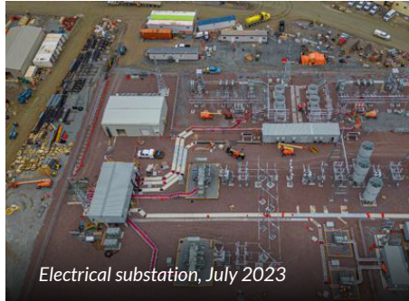
Electrical substation, July 2023