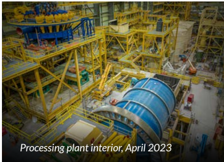
Processing plant interior, April 2023