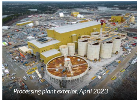
Processing plant exterior, April 2023