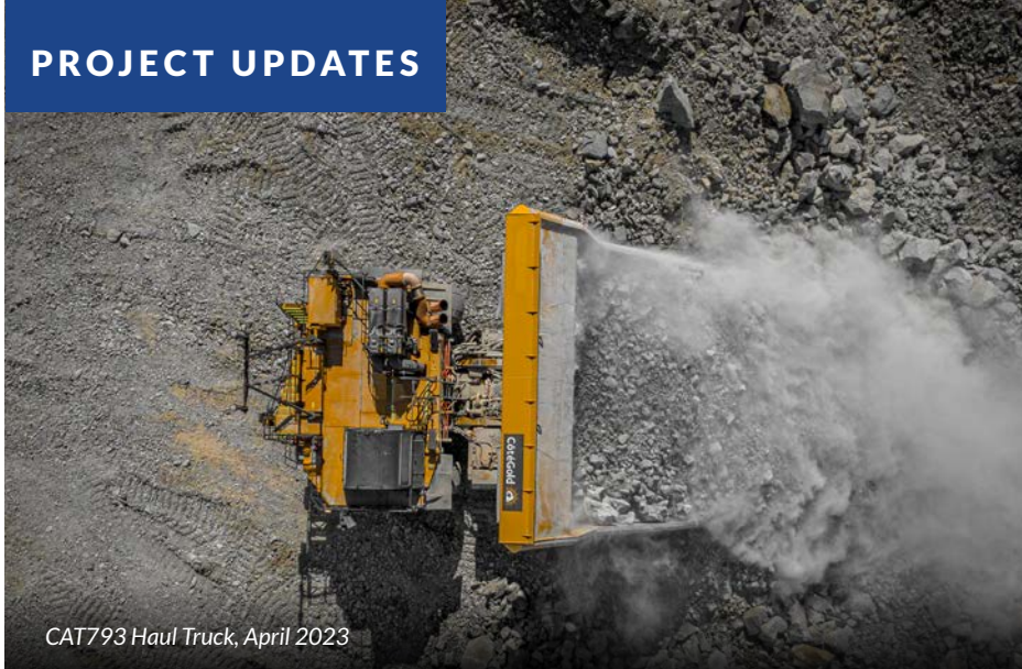
CAT793 Haul Truck, April 2023