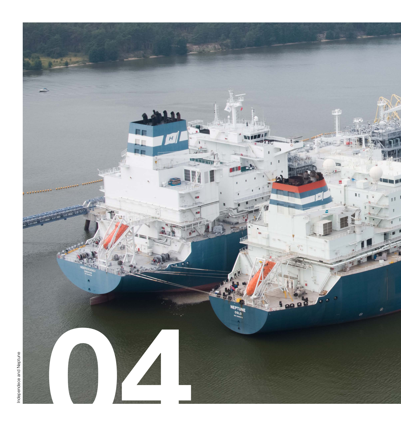
Corporate governance report